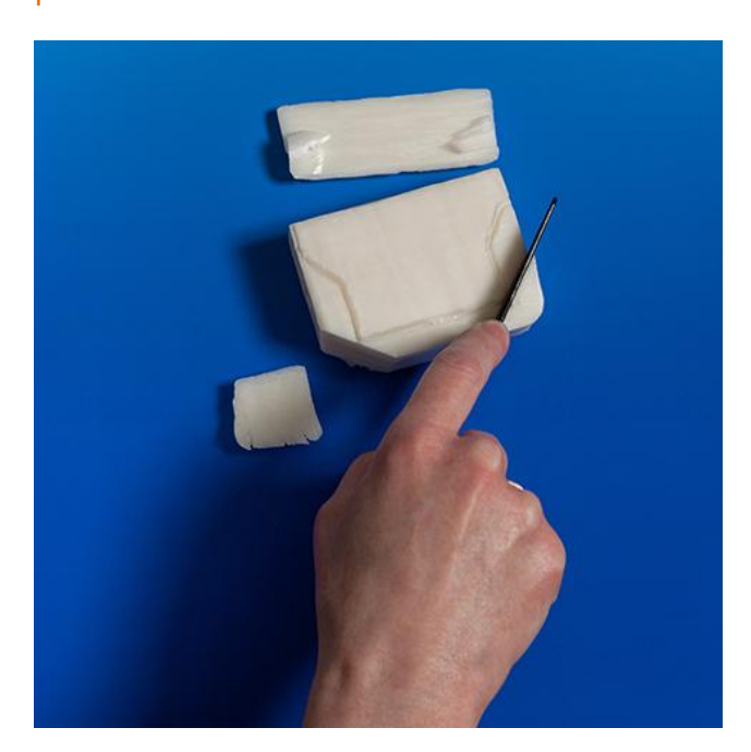
3. Now use the plastic knife. First, remove the corners of the soap and then, the remaining pieces around your outline.