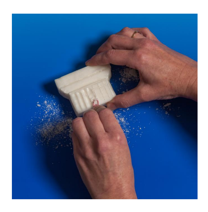
5. Now use the paperclip to carve all these details of the column capital as well as the column flutes!