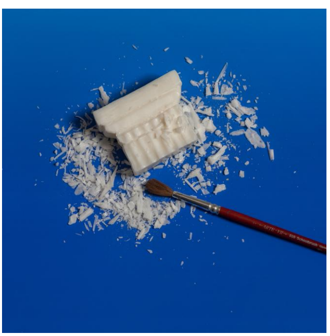
6. Brush away and clean the surface of the soap with your paintbrush.