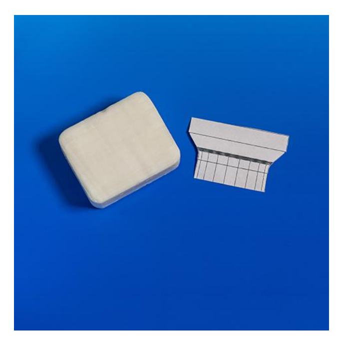
1. Find the instructions in the pdf file and print page 3. Choose the drawing of the capital you prefer more and cut out its outline.