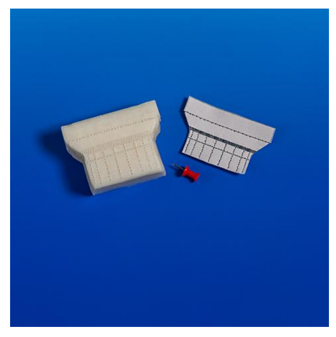
4. To carve the details, put again your printed design on the soap and use the pin or your pencil. Make small and continuous dots following the lines of the design and mark all the details on your sculpture.