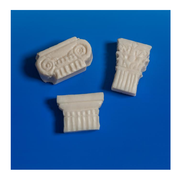
7. Now you can admire your sculpture!